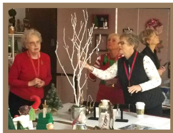
Last minute details before the Fair opened