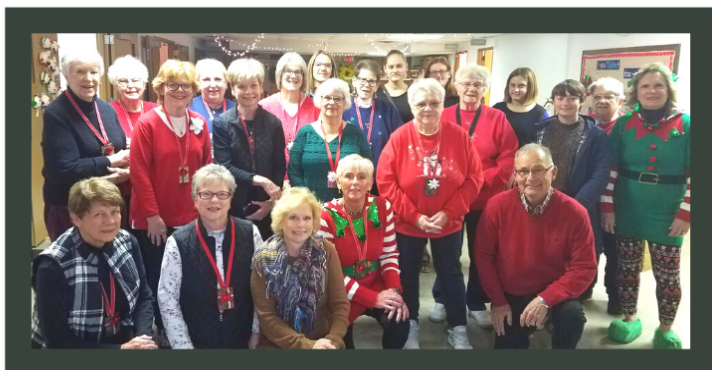
Some of the many Craft Fair volunteers

Once again Thank You to all who participated.