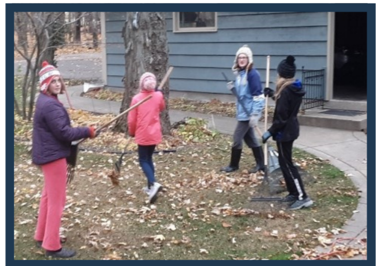
Members of the Youth Group working their way to Texas